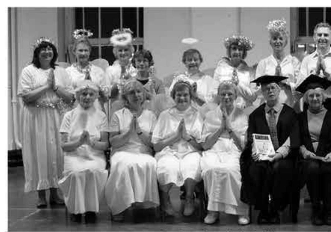
above: the "school photo"